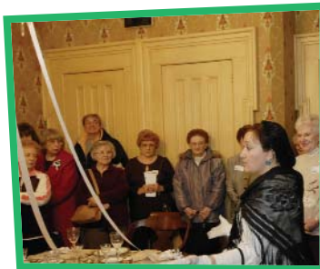
Go back in time at the Kelton House