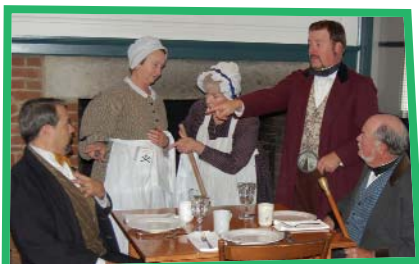
Solve a "Dickens of a Mystery"

Figure out "whodunit" at the entertaining "Dickens of a Mystery" at the Ohio Village . Enjoy a hearty meal while you interact with a historic cast of characters and strive to solve the mystery of this Ohio Village original theater performance.