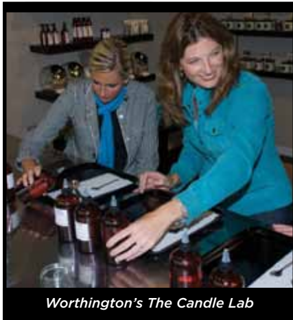
Worthington's The Candle Lab