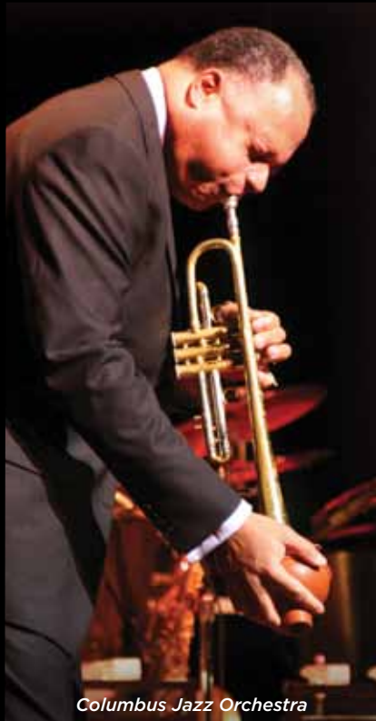
Columbus Jazz Orchestra