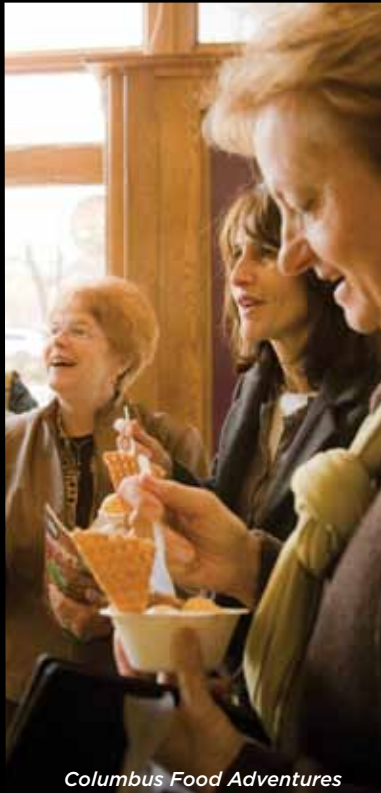
Columbus Food Adventures