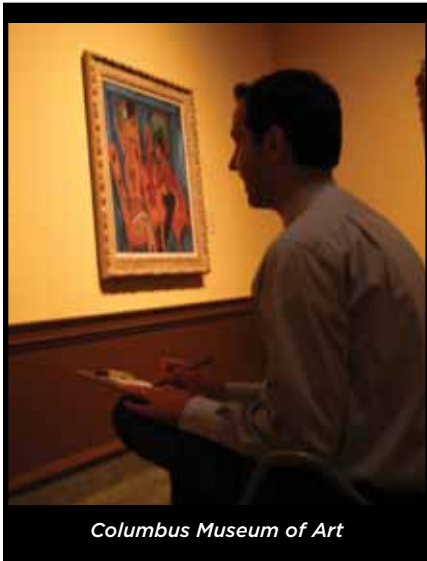
Columbus Museum of Art