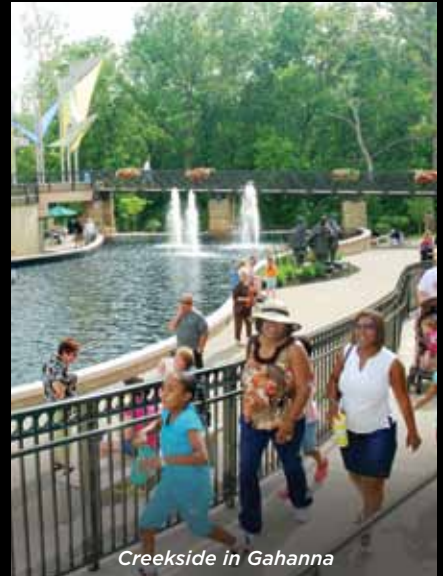
Creekside in Gahanna