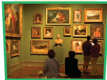
Explore the vast galleries at the Columbus Museum of Art