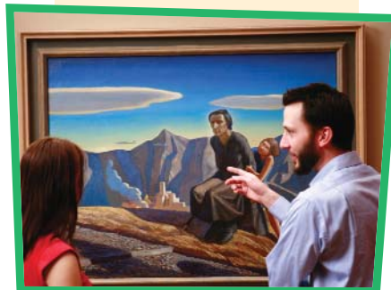
Get an exclusive look at the museum's collection

exhibitions and a state-of-the-art auditorium for lectures, film programs and more. People of all ages will be able to find ways to express and explore their own creativity.