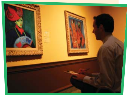
Try your hand at creating art as an Artist for a Day

Leaders from all fields recognize that exploring creativity increases our ability to succeed in life. The Center for Creativity will feature the hands-on Wonder Room, updated studio spaces, family friendly